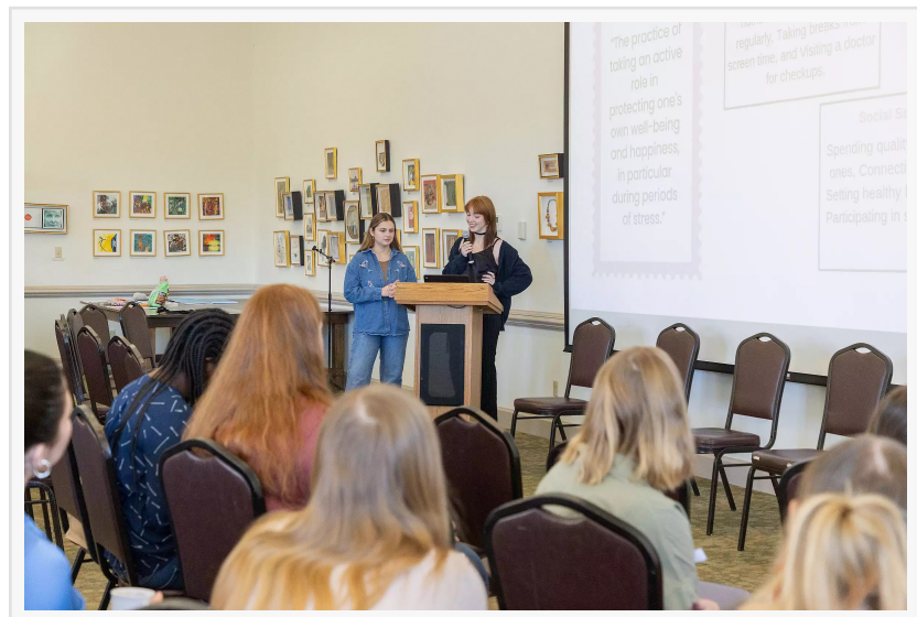
4th Annual ROSE Leadership Conference to Sweet Briar

AMHERST, VA, UNITED STATES, March 4, 2025 /EINPresswire.com/ -- Working as a team. Self-care. Time management. Leadership journeys. These were just a few topics explored on March 1 during this year's ROSE Leadership Conference. Eight students presented their insights and the leadership skills they developed as members of the ROSE program.