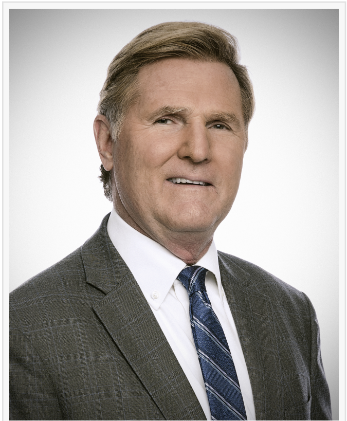
Mike Papantonio, attorney and author of multiple legal thriller novels

PBMs act as middlemen between drug manufacturers, pharmacies, and insurance companies—controlling which medications are covered and how much they cost. According to Papantonio, PBMs operate like corporate extortionists, taking kickbacks from pharmaceutical companies in exchange for placing their drugs on approved insurance lists. This system artificially inflates drug prices, limiting access to cheaper, equally effective alternatives.