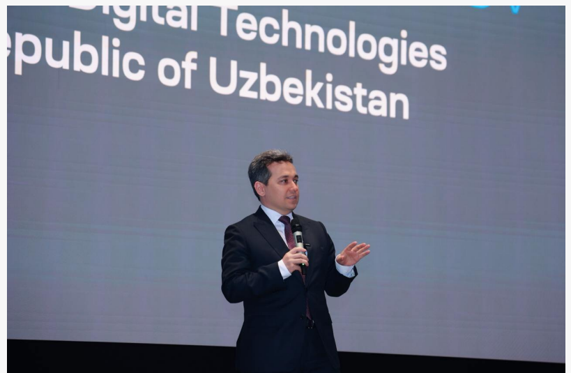
Welcoming speech from the Minister Shermatov