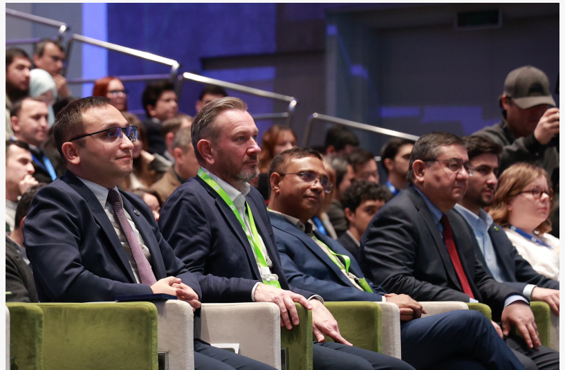
OOC Uzbekistan 2025