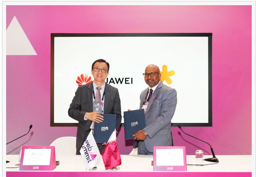
Starlink | Huawei Cloud