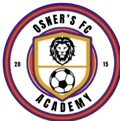
Osner's FC Academy-PPJ

Established in 2015, OSNER'S FC embodies strength, passion, resilience and dedication to the game. Our emblem proudly features a lion, symbolizing power, and a soccer ball, representing the sport we love. This crest reflects our unwavering competitive spirit and relentless pursuit of