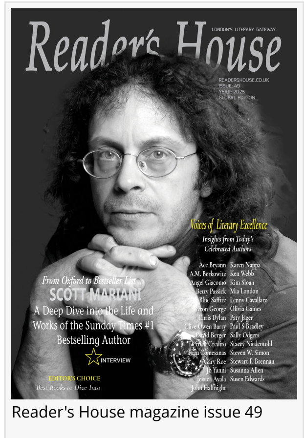
Reader's House magazine issue 49

Gadget' in the subject line, but my brain read it as 'Gigglet.' I laughed out loud and thought, 'That