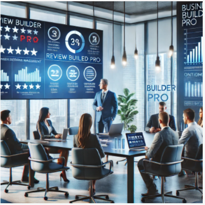
Review Builder Professional

Business Solutions Marketing Group's Review Builder Pro program addresses these challenges by providing a