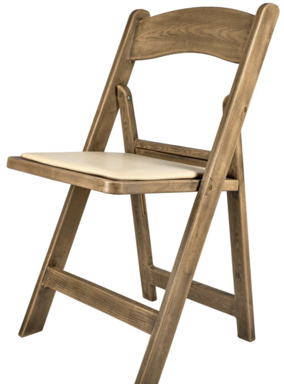
Chestnut Resin Wood Grain Folding Chair