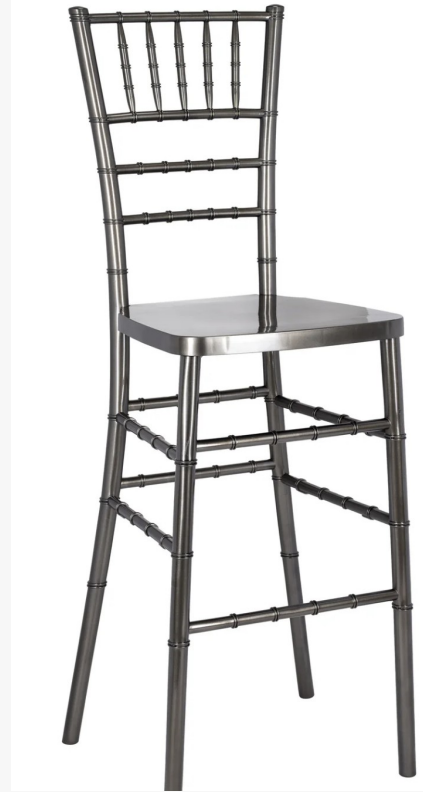
Metallic Silver Onyx Steel Skeleton Barstool