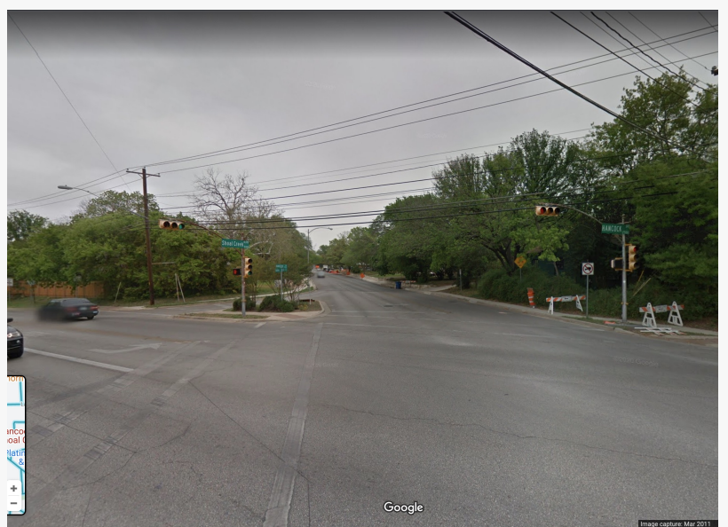
Austin - Shoal Creek Before

“Mobility networks shouldn’t take forever to build. Our AMP Technical Assistance Grant program provides the right tools, coaching, and support to help city leaders move projects from paper to concrete.”