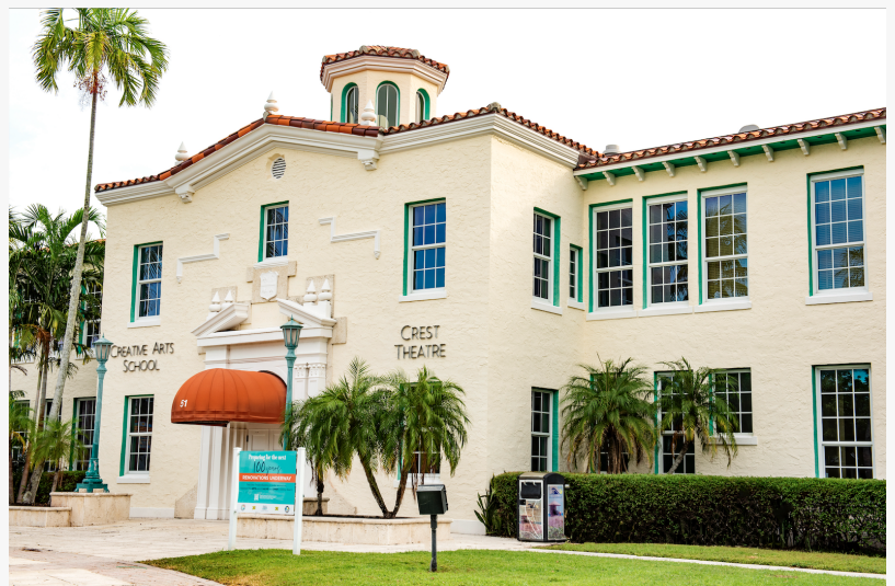
Crest Theater - Creative Arts School