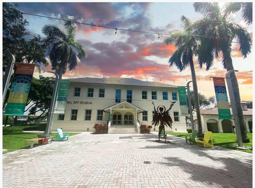
Cornell Art Museum

Old School Square is a historic cultural arts campus in the heart of Downtown Delray Beach. Old School Square's mission is to create a welcoming space where the community comes together for high-quality, diverse and interactive art experiences, while honoring the 100-year-old historic campus. The 6-acre campus is home to early 20th