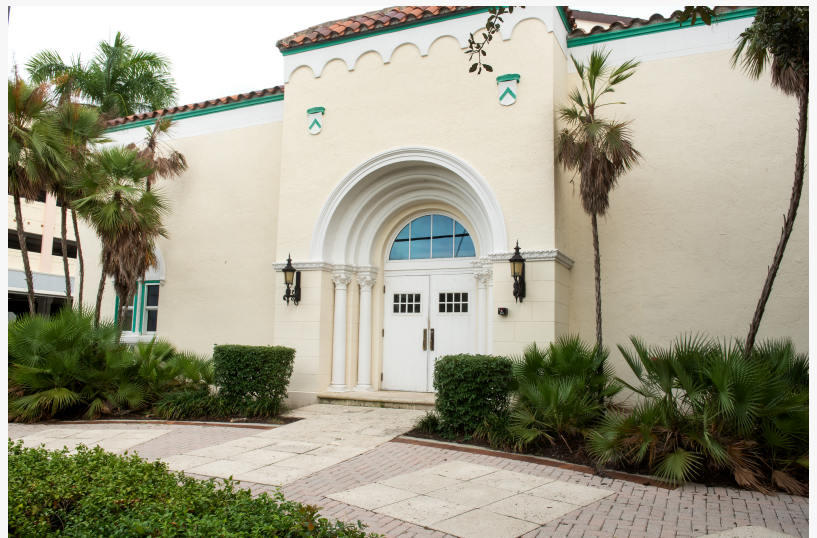
The Vintage Gym