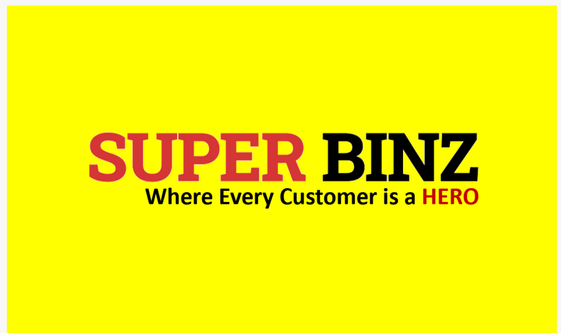
Super Binz Logo