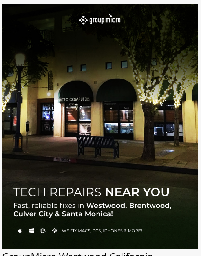
GroupMicro Westwood California