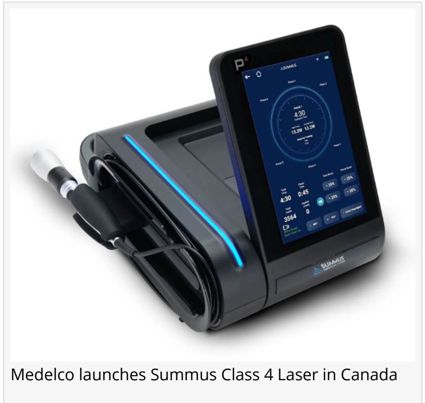
Medelco launches Summus Class 4 Laser in Canada

Summus Class 4 Lasers with state-of-the-art Class IV laser therapy offer comprehensive results. These lasers deliver Photobiomodulation (PBM), a type of light therapy that encourages photochemical reactions in the body.