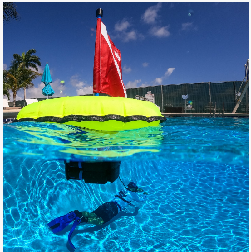
Floating Battery-Powered Dive System, Nomad Mini

BLU3 invites pool professionals, contractors, and industry leaders to visit its booth at the Everything Under The Sun Expo to experience hands-on product demonstrations and learn how Nomad and Nomad Mini can transform their business operations. As a special invitation, BLU3 is offering free entry to the exhibit hall. Get your promo code by emailing info@diveblu3.com .