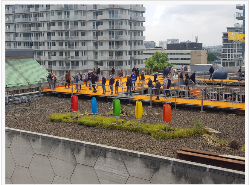
Flower Turbines at Rotterdam Roof Days

turbines separately. This has a tremendous potential effect on the cost of wind energy in urban and suburban commercial and residential projects, or anywhere else where space is limited. The significance is like the difference between being able to put only one solar panel per roof versus many. And Flower Turbines does one better: its turbines make their neighbors perform better. This is an important scientific and business-model innovation.