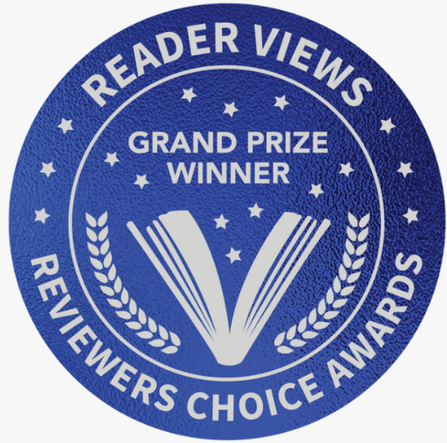
Grand Prize Award Winner

THE READER VIEWS LITERARY AWARDS PROGRAM helps level the playing field for self-published authors, allowing readers to recognize the most creative and exciting new books in the industry. The program is recognized industry-wide as one of the most respected literary awards programs for independent authors. Learn more at