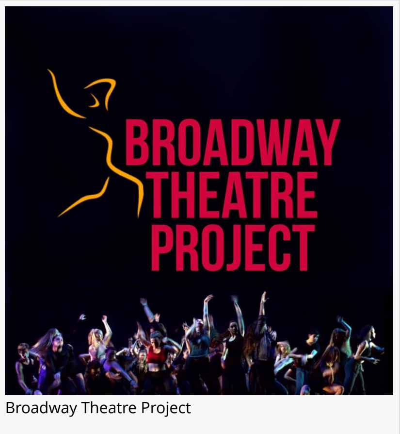
Broadway Theatre Project