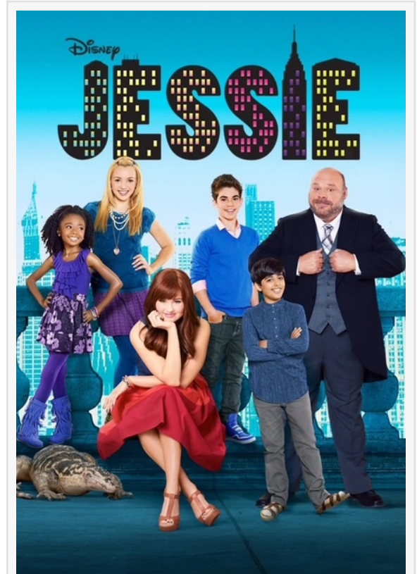
Kevin Chamberlin as Bertram Winkle in Jessie

This press release can be viewed online at: https://www.einpresswire.com/article/791756509