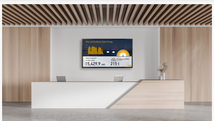
PV Display - Sustainability Reporting with Solarfox

/EINPresswire.com/ -- Many PV installers and businesses face a similar obstacle: even after installing a photovoltaic system - often on a flat or otherwise inconspicuous roof - it remains practically invisible to employees, customers, and the community at large. As a result, the tangible environmental benefits and financial savings tied to the system frequently go unnoticed. This lack of visibility can make it harder to demonstrate a company's commitment to renewable energy and engage stakeholders in meaningful sustainability discussions. Without a way to showcase these positive results, organizations often fail to meet modern expectations for transparency, branding, and regulatory compliance around climate action.