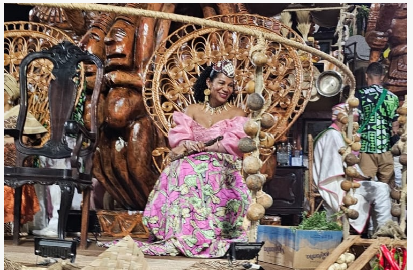
Queen Diambi Kabatusuila at Car 3