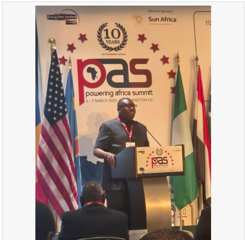
H.E. Honourable Adebayo Adelabu, Minister of Power, Nigeria

“These investments reflect our commitment to sustainable development and the creation of shared value in Africa. We believe the continent’s future depends on a collaborative and innovative approach that brings all stakeholders together around a common vision,” emphasized