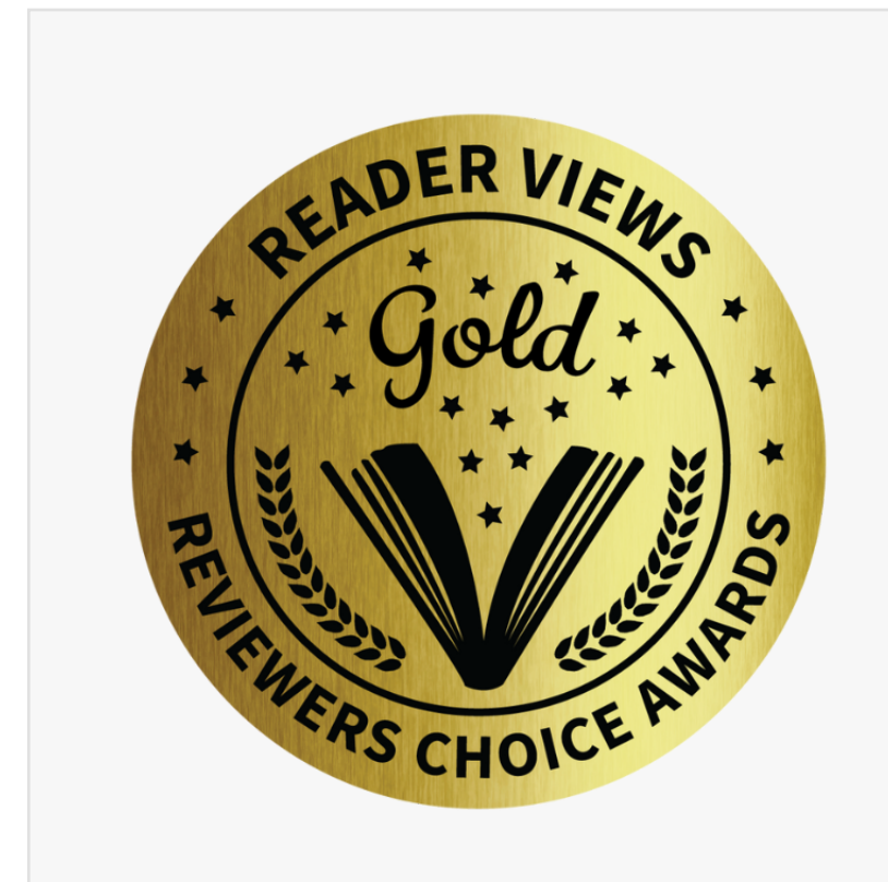
Gold Award Winner

Reader Views reviews more than 2,000 books each year by self-published and