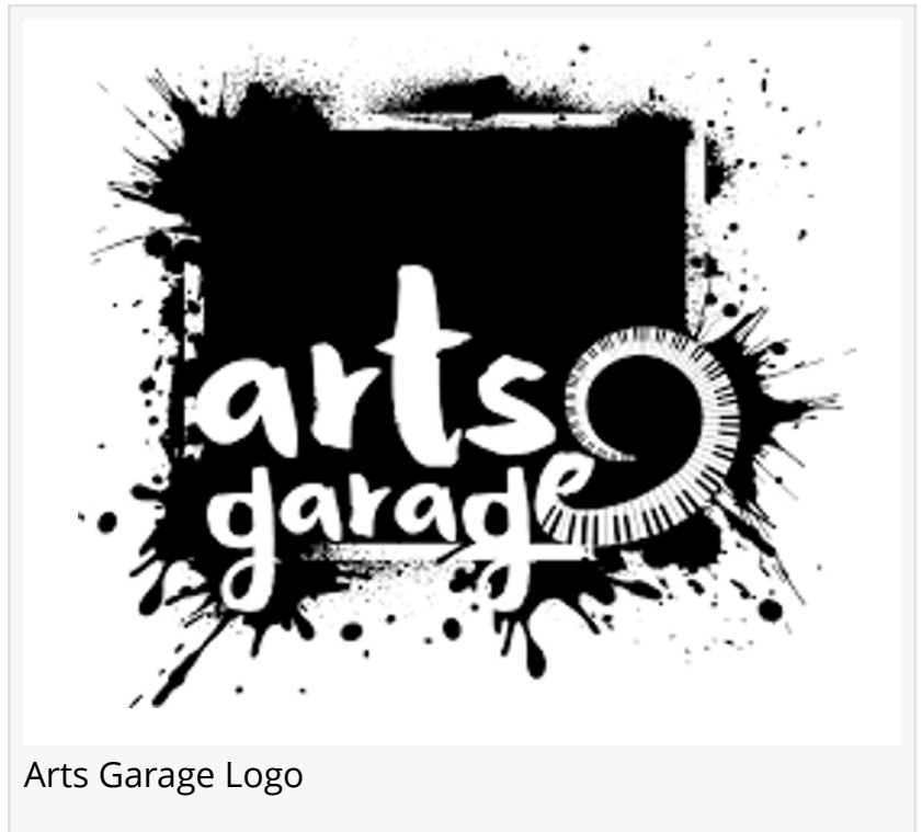
Arts Garage Logo

DELRAY BEACH, FL, UNITED STATES, March 11, 2025 /EINPresswire.com/ -- Arts Garage , a Visual & Performing Arts Venue located in Delray Beach that connects the community to the world through the arts, has announced an exciting new exhibition, 'Icons, Idols, and Adoration,' which is on display in the Marshall Family Foundation Gallery (94 NE 2nd Ave, Delray Beach, FL 33444) through April 28, 2025.