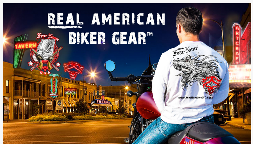
Saturday Night in a small town photo.