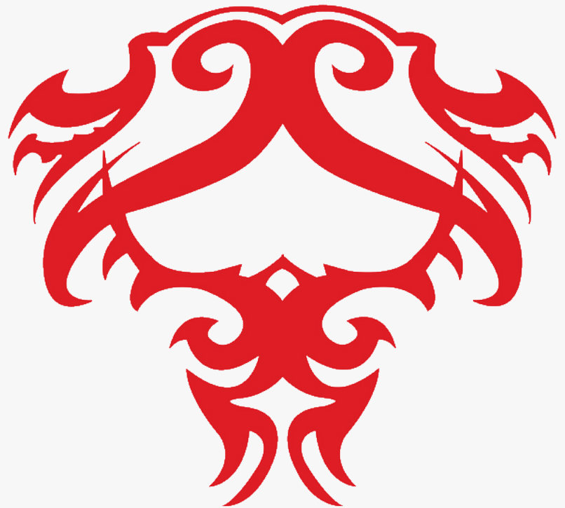
Fear-NONE Motorcycle Clothing & Gear Logo

The new products will encompass all aspects of the current FEAR-NONE 800 item product catalog from original hoodies to t shirts to jeans to jackets and headgear. Unlike mass-produced motorcycle clothing, FEAR-NONE is built on the principles of being 1000% American made, exclusivity, originality and durability. Each FEAR-NONE piece is 100% designed and made in the USA, ensuring superior craftsmanship and longevity. The FEAR-NONE brand's signature apparel,