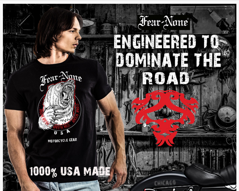
Fear-NONE Motorcycle Gear Proudly USA Made

What sets FEAR-NONE apart is its unique approach to design and 1000% Made in America philosophy. The brand's graphics, designs, artwork, and logos are original, powerful, and unabapologetically American proud and rebellious—reflecting the fearless lifestyle of real American bikers.