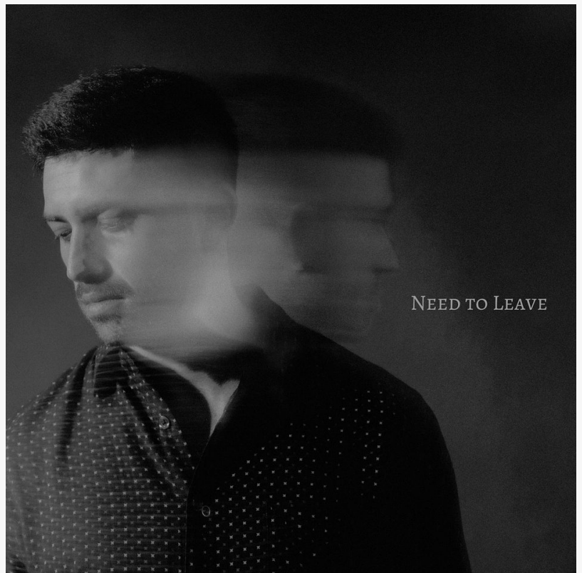
Cover art for "Need To Leave" by Maxwell Macey

As Maxwell later relocated to the Pacific Northwest, the track also represents a poignant meditation on breaking free from toxic cycles, embracing change and finding clarity in the vastness of natural spaces. The chorus serves as both a literal and metaphorical expression—leaving behind a physical space as well as the emotional weight of an unfulfilling life chapter.