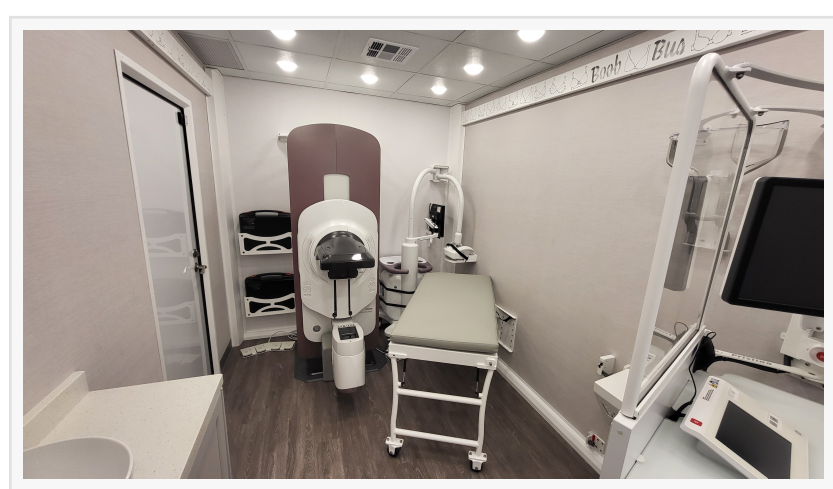
ABUS suite inside The Boob Bus

SOUTH JORDAN, UT, UNITED STATES, March 7, 2025 /EINPresswire.com/ -- The Boob Bus, Utah's mobile mammography service dedicated to increasing access to life-saving breast health screenings, proudly celebrates its first full year in operation. In just 12 months, The Boob Bus has made a remarkable impact, serving over 1,350 women, and diagnosing 10 cases of breast cancer—including three in women under the age of 50.