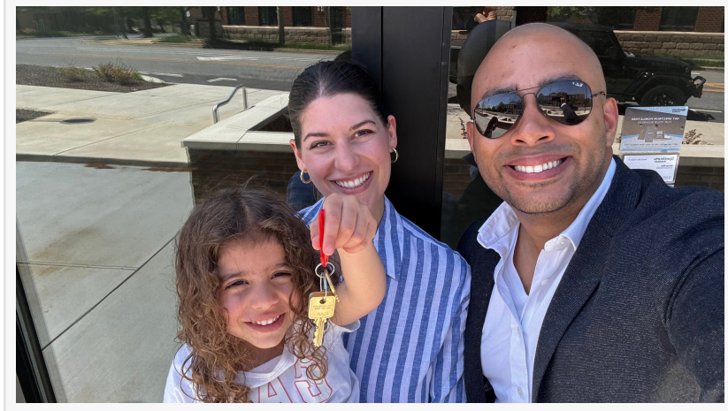
Lopez's are Excited to Bring Sugar Sugar to Charlotte.

With a proprietary line of organic, vegan, and sustainable beauty products, Sugar Sugar™ continues to innovate in the clean beauty space. The company's commitment to cuttingedge technology, science-backed skincare, and all-natural ingredients ensures that clients receive not only exceptional service but also long-term solutions for their beauty needs.