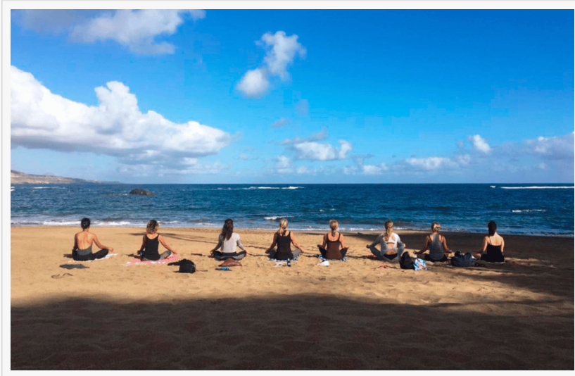
See Yoga Retreats Beach Meditation Class in Gran Canaria Canary Islands

Yoga Retreat: Perfect for yoga enthusiasts or those seeking relaxation, this package includes daily yoga sessions, peaceful beach meditations, enriching yoga workshops, and mindfulness hikes that promote inner peace and harmony.