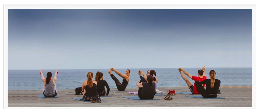
See Yoga Retreats Beach Yoga Class in Gran Canaria Canary Islands

LAS PALMAS DE GRAN CANARIA, LAS PALMAS, SPAIN, May 6, 2025 /EINPresswire.com/ -- See Yoga Retreats Canary Islands proudly announces an exciting, flexible way to experience yoga holidays in the stunning Canary Islands. Located on the sunny shores of Gran Canaria, See Yoga Retreats provides guests with the