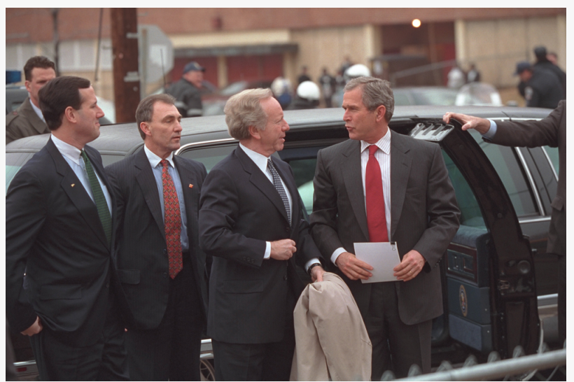
Senator Joe Lieberman and President George W. Bush Exit the Presidential Limousine

President George W. Bush: "Joe wasn't afraid to engage with Senators from across the aisle and worked hard to earn votes from outside his party. We pray that Joe's example of decency guides our Nation's leaders now and into the future."