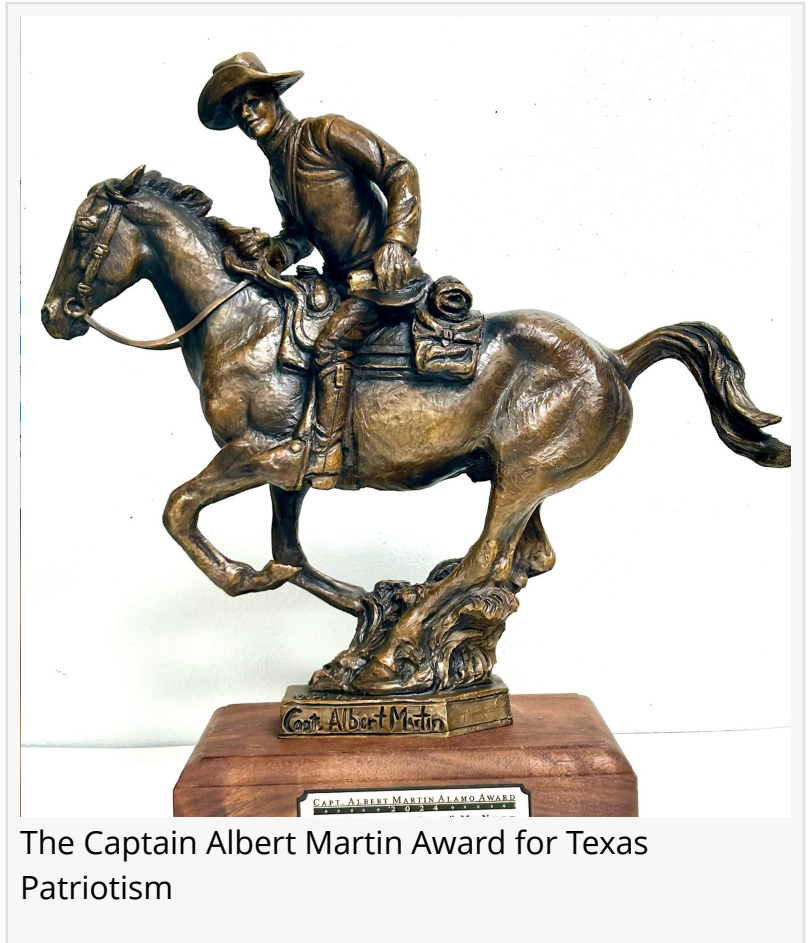
The Captain Albert Martin Award for Texas Patriotism

The Alamo Letter Society mission is to educate school children, new Texans, and future generations, of their forefathers' armed struggle for Liberty and Freedom, through the placement of a large, bronze plaque containing the 220 word Col William Barrett Travis "Victory or Death" Alamo letter at each of the 254 courthouses in the Lone Star State. The Society is dedicated to the two leading Tejanos of the Texas Revolution, Jose Antonio Navarro and Juan