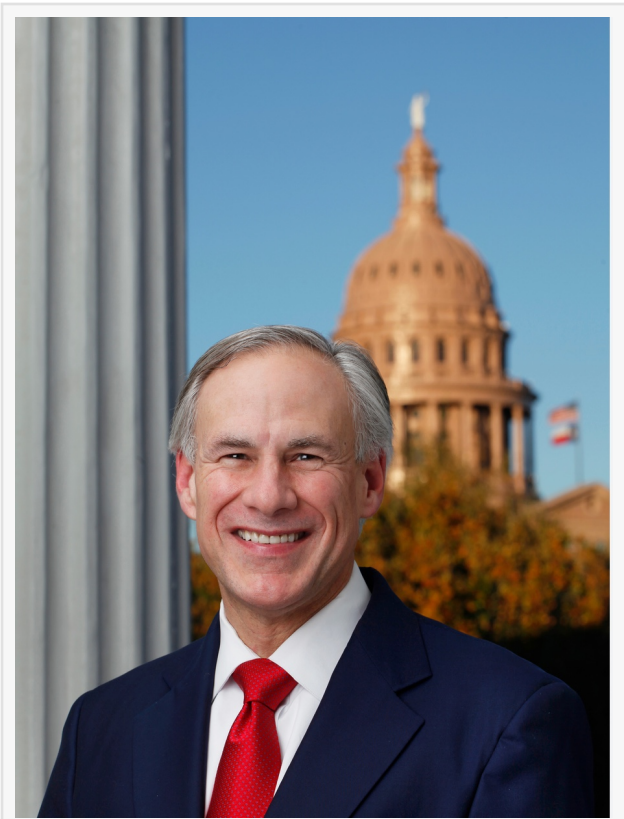
Photo Gov Greg Abbott