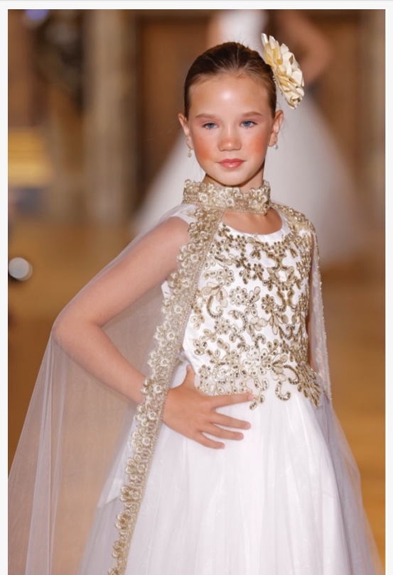
Princess of the Universe at hiTechMODA Paris Season 3 Show

This press release can be viewed online at: https://www.einpresswire.com/article/792383010