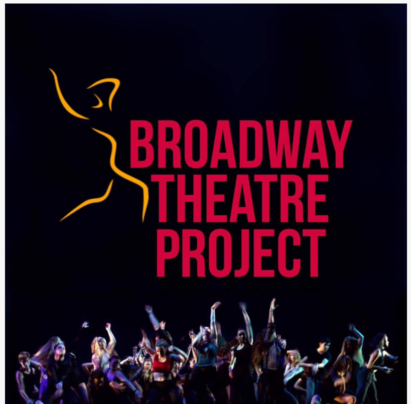
Broadway Theatre Project