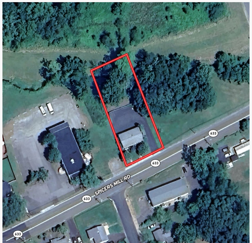
161 Spicers Mill Rd., Orange, VA22960

Online only bidding begins to close on Thursday, March 13, 2025 @ 12:00 PM EDT 161 Spicers Mill Rd., Orange, VA22960