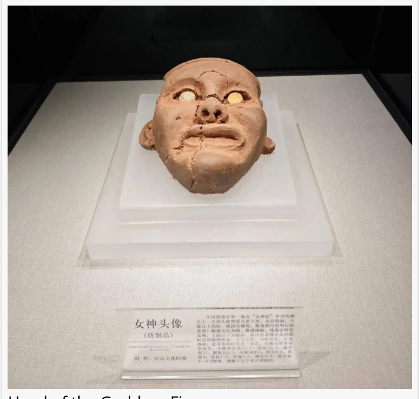
Head of the Goddess Figure

Recognized as one of the "Top 100 Archaeological Discoveries of the Century," the Niuheliang site in Chaoyang City, Liaoning Province, has captivated archaeologists and the