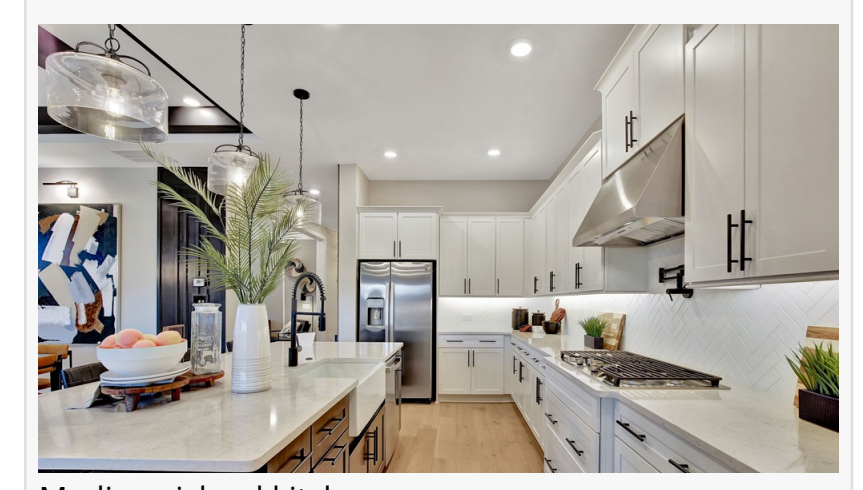
Madison island kitchen

configurations and a daylight basement, per homesite. Like all homes at Cresswind at Spring Haven, The Madison also maximizes volume with increased window square footage and ceiling heights at 11'4 in living areas and 14" in the foyer.