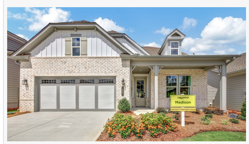
Madison front exterior