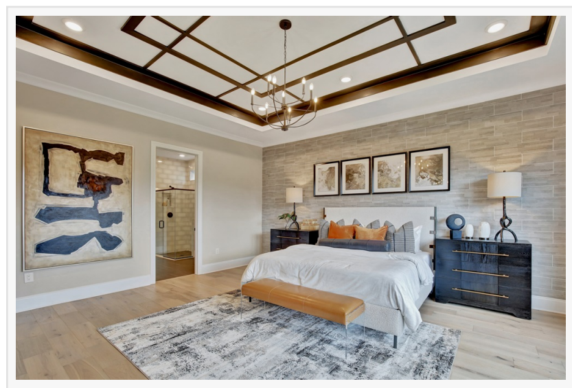
Madison primary suite

Additional structural options include a sunroom, a four-foot rear extension of the home, second-floor bonus room