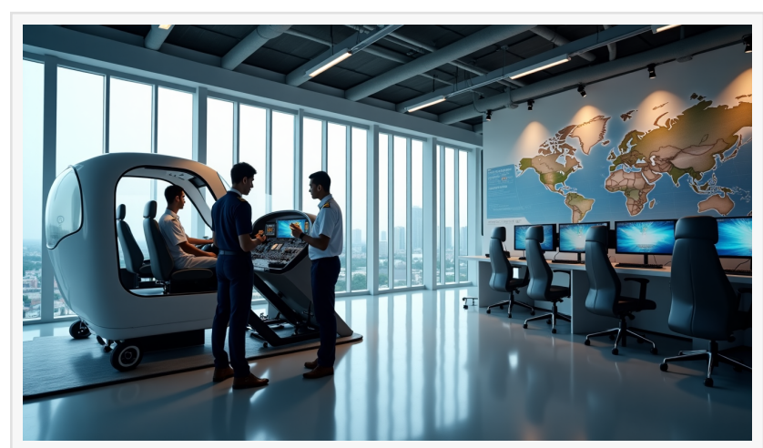
DGCA Pilot Ground School Office India