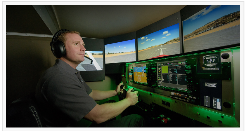
Commercial Pilot School

DGCA maintains rigorous certification protocols matching international benchmarks. India secured its FAA IASA Category 1 status through extensive reviews across April, July and September 2022 [3]. This achievement enables Indian carriers to expand American routes and establish US airline partnerships [3].