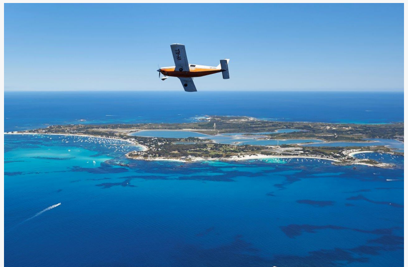
FlyOnE Decarbonised Air taxi transferring passengers to Rottneest Island, Western Australia's favourite island getaway location