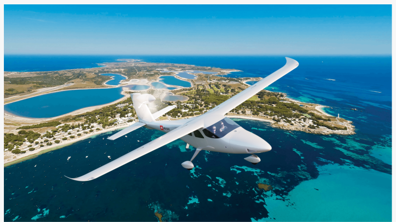
Smartflyer electric passenger plane over Rottnest Island

FlyOnE has secured early serial numbers for a pipeline of over 100 electric and hybrid aircraft in 5 separate air frame formats for decarbonised Pilot training and air transport, with Electric