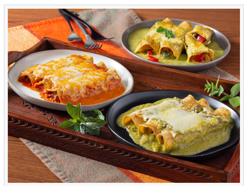
Demeter's Pantry Plated Enchiladas

This press release can be viewed online at: https://www.einpresswire.com/article/792387778