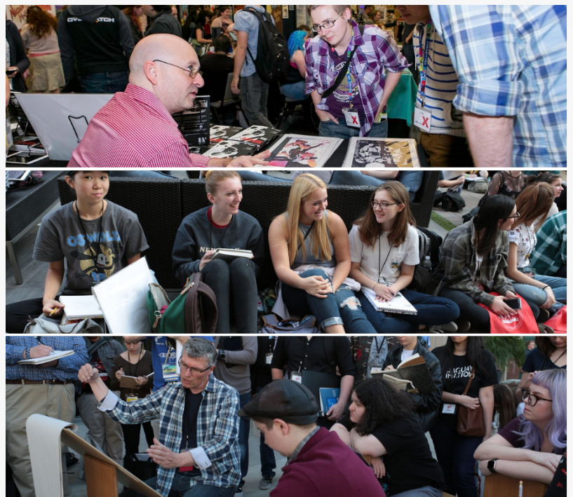
CTN Selection of Images 'No Artist Left Behind'