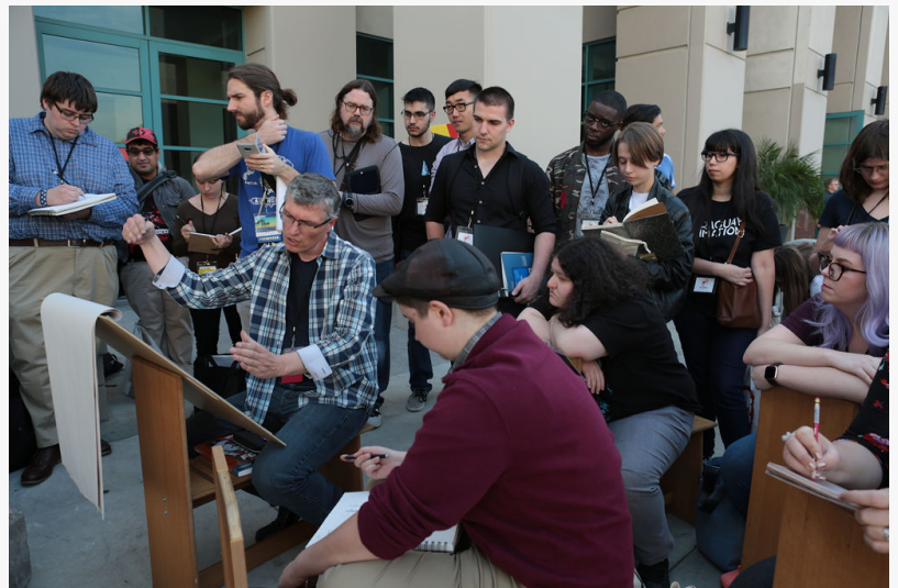
CTN Xpo Life Drawing