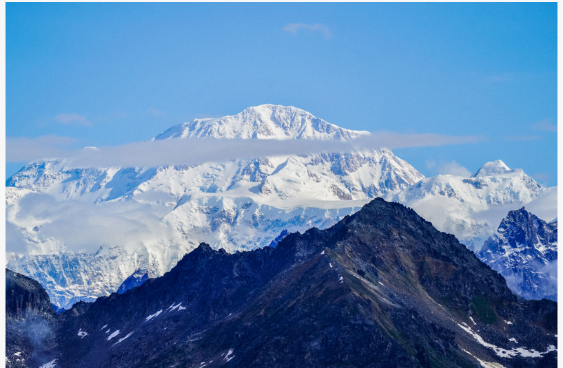
Denali National Park

Denali National Park: Spanning more than six million acres, Denali National Park epitomizes the raw and untamed beauty of Alaska. Home to North America's tallest peak, Denali offers an extraordinary wilderness experience where vast glaciers, snow-capped mountains, and roaming wildlife create an adventurer's paradise. Beyond its legendary hiking trails, visitors can embark on aerial tours, witness the northern lights, and paddle through pristine waters. Chelatna Lake, a premier fishing destination, teems with Pacific salmon, trout, and grayling. Visitors can take a kayak, SUP board, or raft out on the water. The best time to explore Denali is from June to August when the days are long, and wildlife is most active.