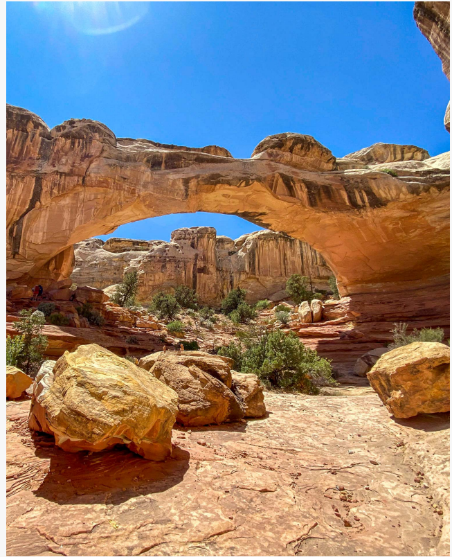
Capitol Reef National Park

reservations are needed, and the beautiful town of Torrey, Utah, is a great place to rest your head after a day of hiking, canyoneering, and taking in the stunning landscape. Defined by the striking Waterpocket Fold—a 90-mile-long geologic wrinkle—Capitol Reef National Park was established to protect this grand and colorful geologic feature and the spectacular eroded jumble of cliffs, domes, monoliths, twisting canyons, and graceful arches. The Fold extends 70 miles from Thousand Lake Mountain to the Colorado River (now Lake Powell). Visitors can enjoy hundreds of miles of trails and unpaved roads into the scenic backcountry. While the park is worth visiting year round, the best time of year to visit Capitol Reef National Park is often considered March- June or September-October.