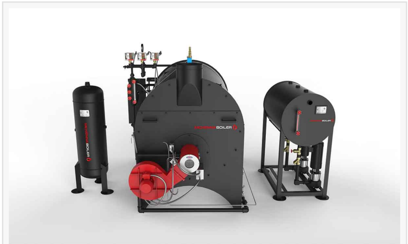
Commercial boiler lineup in Los Angeles

LOS ANGELES, CA, UNITED STATES, March 10, 2025 /EINPresswire.com/ -- McKenna Boiler Works, Inc., a recognized leader in boiler design, manufacturing, and maintenance, is proudly celebrating over 100 years of operation. Founded in 1921, the company has grown from a small family-run business to a trusted industry innovator, providing advanced, reliable boiler solutions across Southern California and beyond. Today, McKenna Boiler remains steadfast in its mission to deliver high-quality products and services to clients, keeping their operations running smoothly and efficiently.