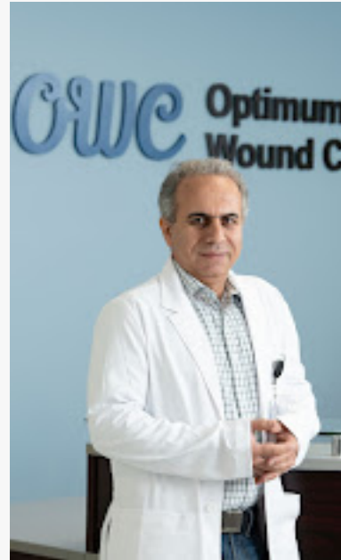
Bringing Cutting-Edge Treatment to the Community