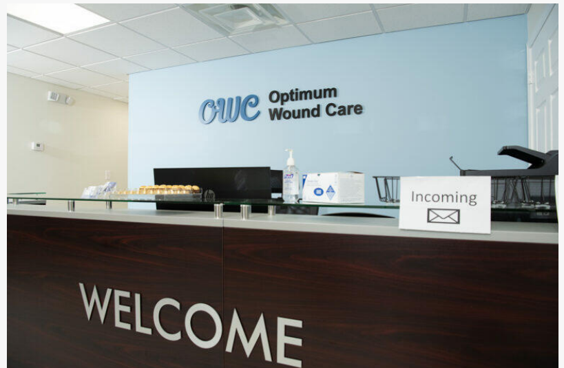
Advanced Wound Care Services in Louisville