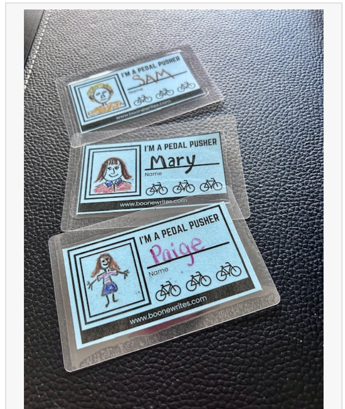
Create a custom drivers license