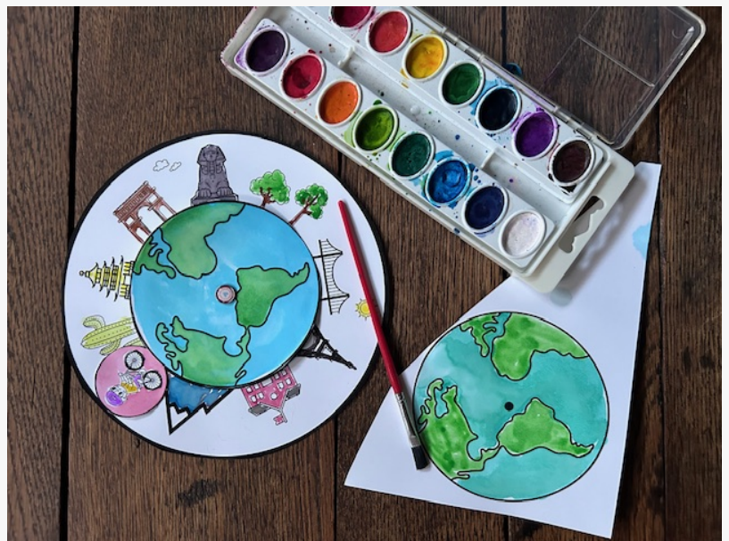
Children create a custom watercolor and paper globe spinner