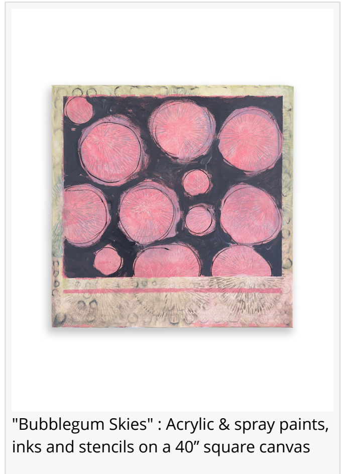
"Bubblegum Skies" : Acrylic & spray paints, inks and stencils on a 40" square canvas

Superfine Art Fair , Brooklyn Navy Yards (April 24-27, 2025): A contemporary art fair featuring independent artists, Superfine offers a direct connection between collectors and creators. Glick's