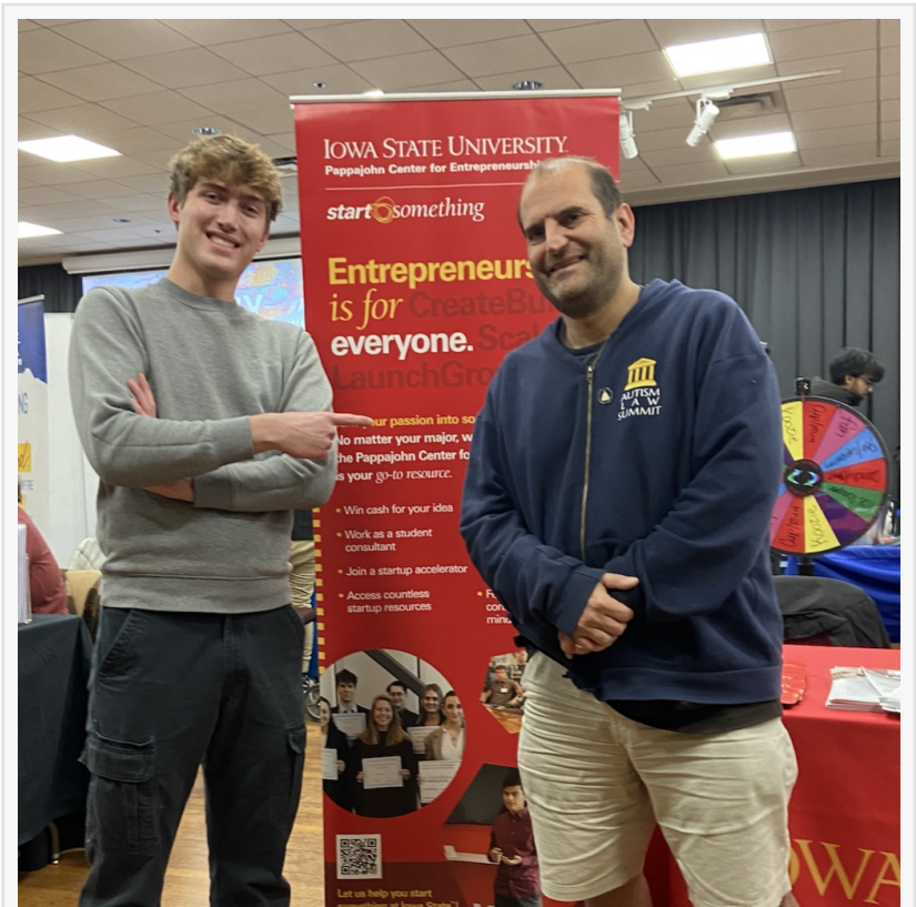
TravelingWiki Foundation's CEO Meets with the CEO of Iowa State University's Entrepreneurship Club to Promote Autism Awareness