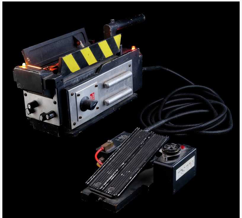
Screen-Matched Light-Up Radio-Controlled Hero Ghost Trap and Pedal est. $150,000 - $300,000

LOS ANGELES, CA, UNITED STATES, March 11, 2025 /EINPresswire.com/ -- Propstore's Entertainment Memorabilia Live Auction, taking place from March 26 - 28, 2025 in Los Angeles, will feature over 1,350 rare and screen-used props, costumes, and collectibles from some of cinema's best loved films and television shows, with an estimated total value of $8 million. Among the incredible lots up for sale, there will be a fantastic selection of sci-fi lots, including items from Star Trek, Back to the Future, Ghostbusters, and Blade Runner, giving fans the chance to own a piece of their favourite sci-fi classics!