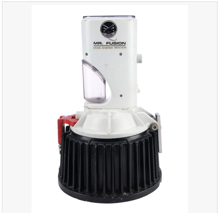
Screen-Matched "A" (Hero) Car DeLorean Time Machine's Mr. Fusion Reactor est. $75,000 - $150,000

- GHOSTBUSTERS (1984)/GHOSTBUSTERS II (1989) Screen-Matched Light-Up Radio-Controlled Hero Ghost Trap and Pedal est. $150,000 - $300,000