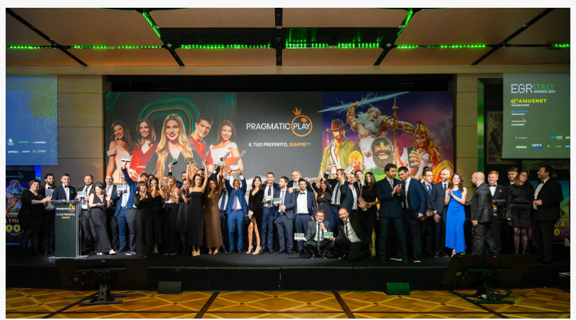
Team Hub Affiliations EGR Italy 2024