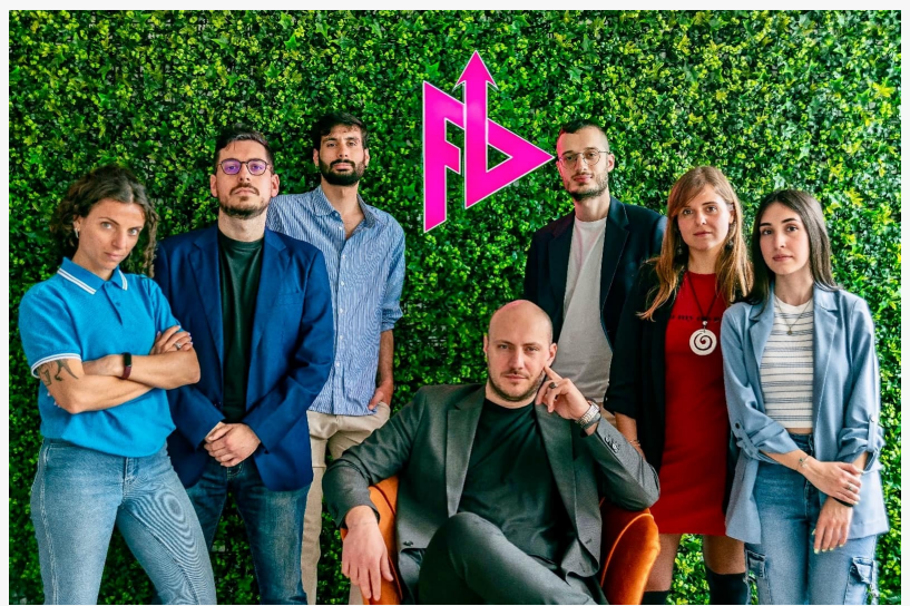
Il team di Famacs Agency

Hub Affiliations maintains a robust presence in the Affiliate industry through partnerships with leading brands. These collaborations have significantly enhanced Hub Affiliations' market reach and operational excellence, exemplifying its status as a trusted partner in the affiliate marketing ecosystem.