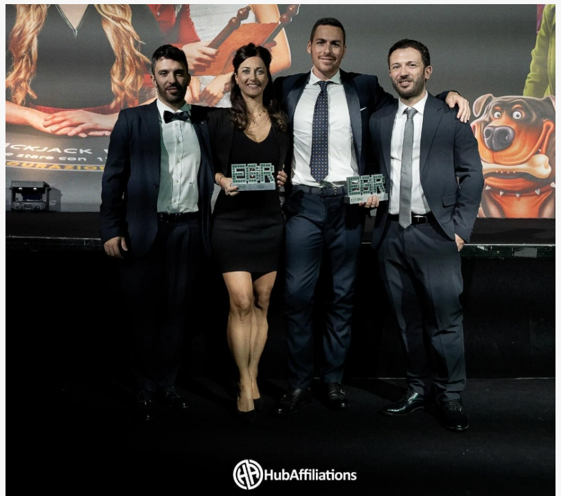
Il team di Hub Affiliations