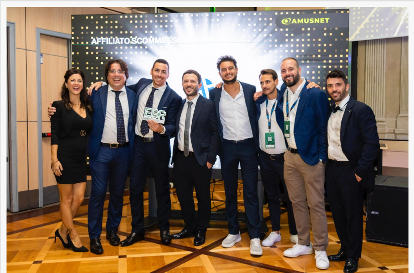
Il team di Hub Affiliations

The Sigma Awards celebrate outstanding achievements and innovations within the Marketing