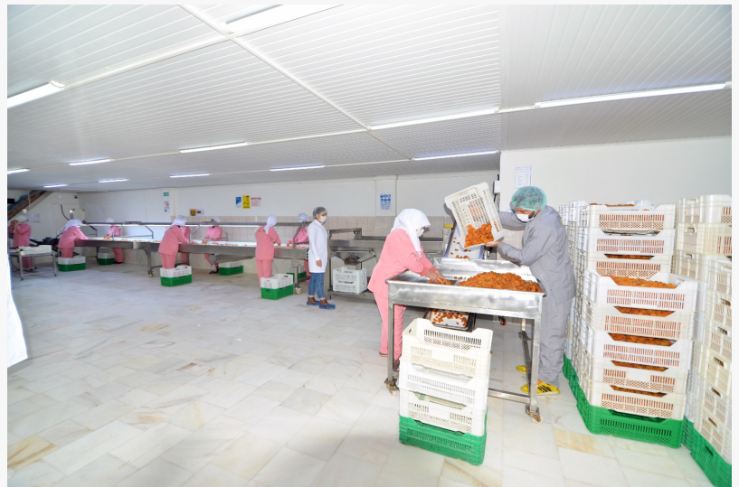
Dried Apricots Production