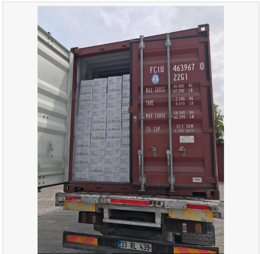
Dried Apricots Shipments

Sustainability has become a focal point in dried apricot production, with many suppliers implementing eco-friendly initiatives. Water conservation techniques, responsible land management, and reduced pesticide usage are some of the measures being adopted to protect