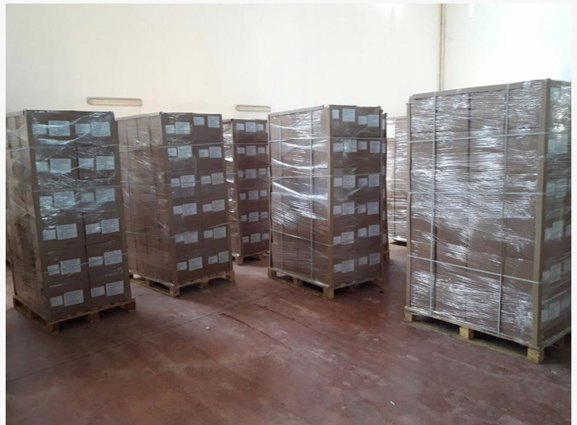
Wholesale Dried Apricot Supplier and Exporter