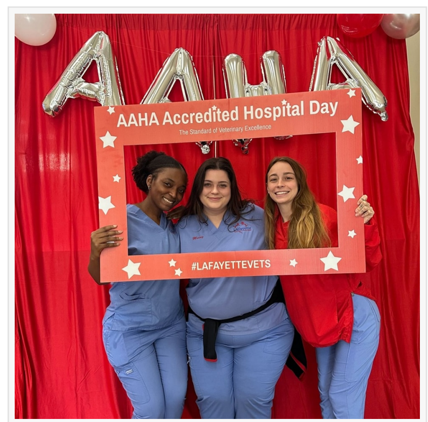
Lafayette Veterinary Care team, Lafayette, LA celebrating AAHA Day

Unlike many other industries, veterinary practice accreditation is not mandatory in North America. AAHAaccredited hospitals voluntarily choose to undergo a rigorous evaluation process that examines nearly every aspect of veterinary medicine delivery. The evaluation process encompasses a comprehensive on-site assessment conducted by experienced teams who evaluate up to 1000 standards across 18 major areas of veterinary practice. AAHA's Accreditation Specialists continually support our members as they prepare for their on-site evaluation with a Practice Consultant who will examine areas relating to anesthesia practices, diagnostic imaging, emergency services,