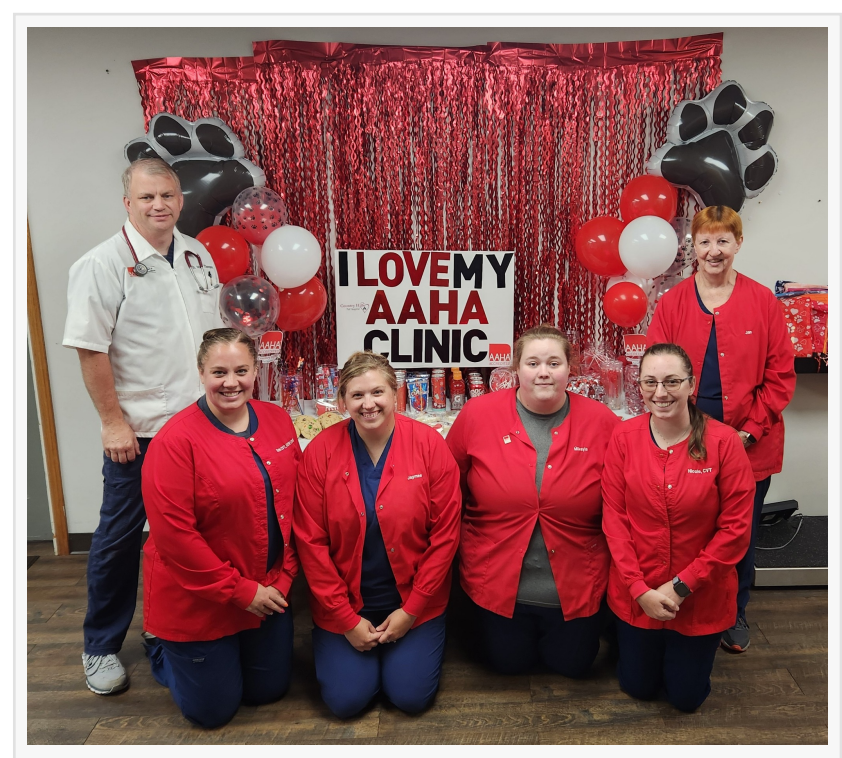
Country Hills Pet Hospital, Eden, WI celebrating AAHA Day

LAKEWOOD, CO, UNITED STATES, March 11, 2025 /EINPresswire.com/ -The American Animal Hospital Association (AAHA) today announced its accreditation program has been incorporated as a significant factor in Newsweek's newly launched rankings of America's Best Animal Hospitals. This recognition reinforces AAHA's long-standing commitment to advancing excellence in veterinary care through its comprehensive accreditation program.