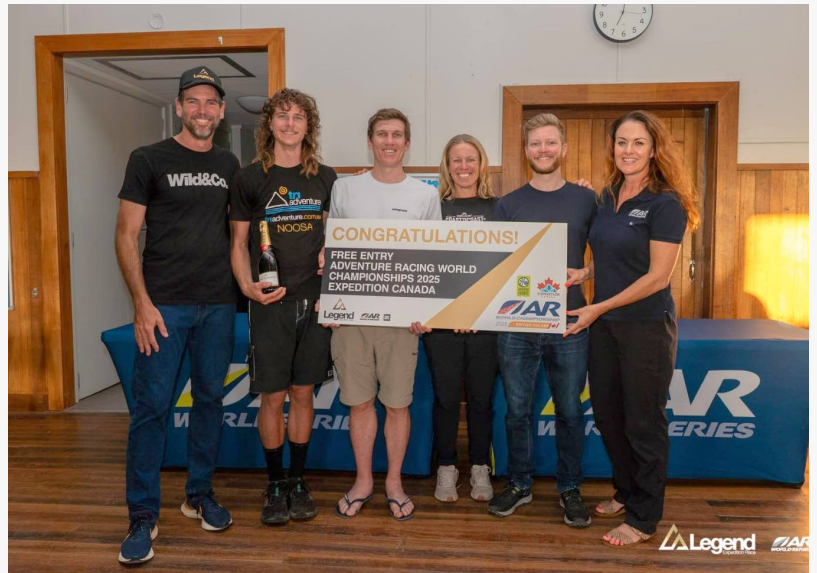
Race winners Broken Compass AR