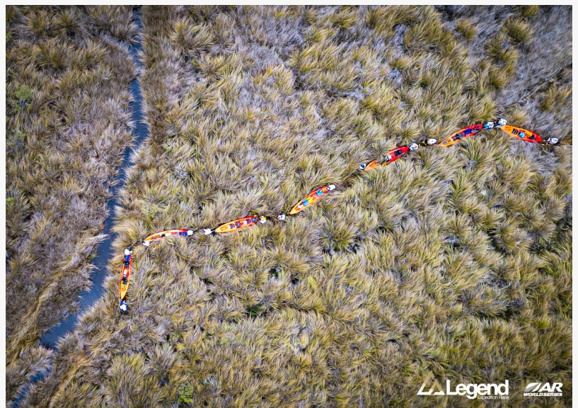
Kayak Portage at the Legend race