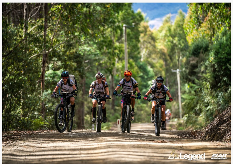
Mountain biking in Tasmania at the Legend Race