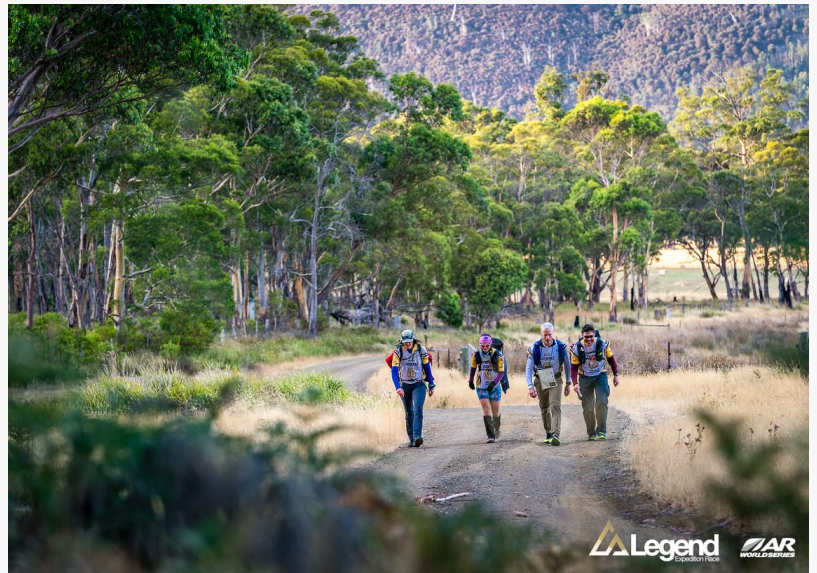
Trekking in Tasmania at the Legend race