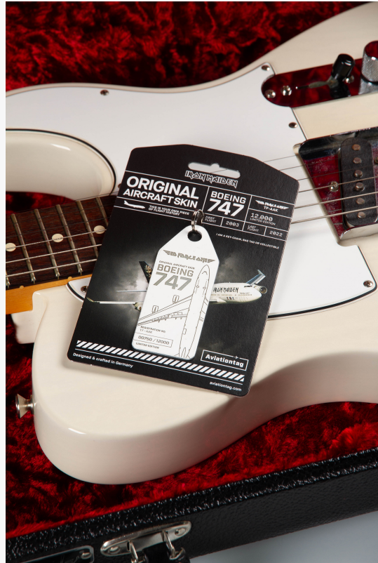
Aviationtag x Iron Maiden Ed Force One